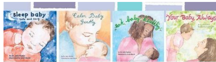
Health Literacy Bundle