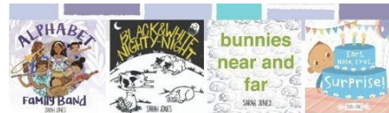
NEW Bundle Available Concept Rich Bundle