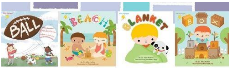
Baby Unplugged Bundle

Enjoy our specially curated bundles perfect for any outreach program! When you order bundles, books are further discounted to $2.25/book.