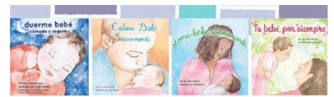
Spanish Language Bundle