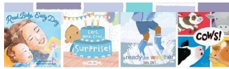
Early Literacy Bundle